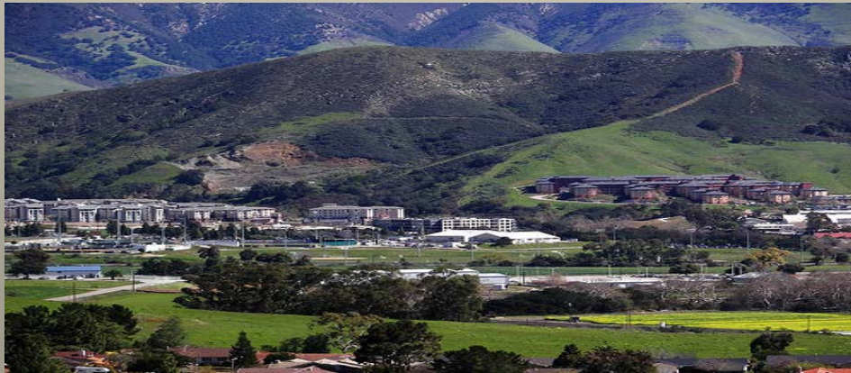
Cal Poly San Luis Obispo