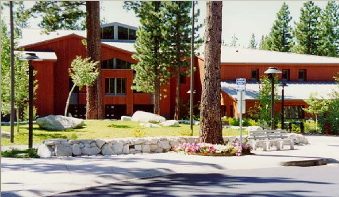
Lake Tahoe Community College